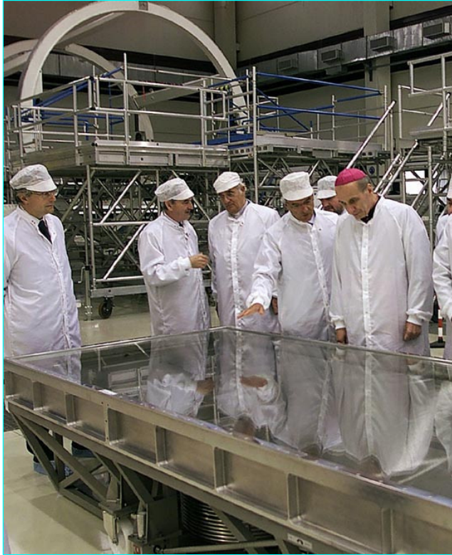
Delivery of the RELIQUARY to the Archbishop of Turin Cardinal Severino Poletto (November 6th, 2000)