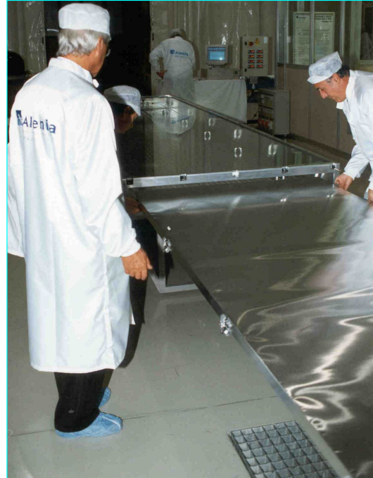
The Container, or Reliquary, contains a sliding and extractable Table on which the Shroud is kept fixed in a flat position.