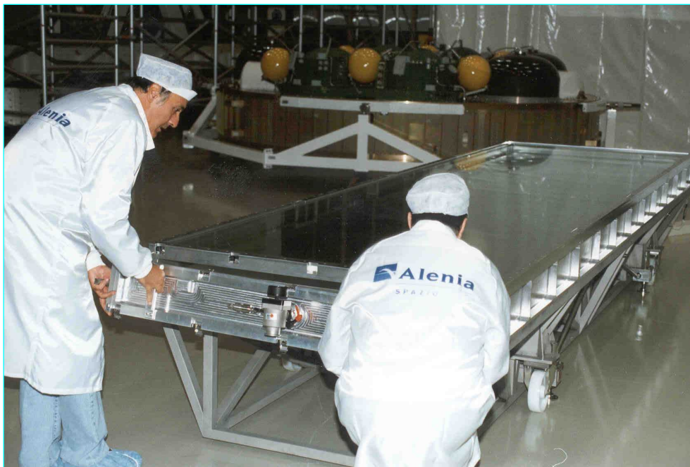
Access panel Opening and closing tests