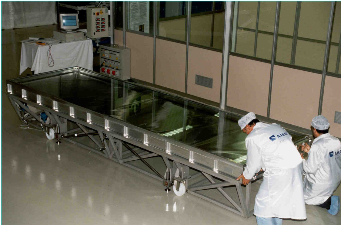
Complete view of the Reliquary Assembling phase in the Laboratories of Thales Alenia Space Italia of Turin

After the fire, on the 12th of April 1997, in the Guarini Chapel close to the Cathedral of Turin where the Shroud was kept, the matter of conservation and security of the Shroud became even more critical. The Committee of Conservation, composed of internationally renowned experts and established by the former Caretaker of the Shroud, Cardinal Saldarini, performed an in-depth study of the complex questions linked to the optimal conditions of conservation and to the need for safely accessing the Shroud during public exhibitions. The first phase of the "project of conservation" resulted in the production of a reliquary for the exhibition of 1998; which would meet the requirements of a short-lived event such as a public exhibition. However, for long-term conservation, a specific reliquary utilizing the most modern technologies of planning and production was needed.